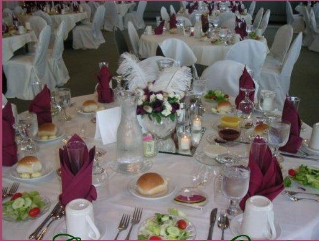
Catering on the Quad