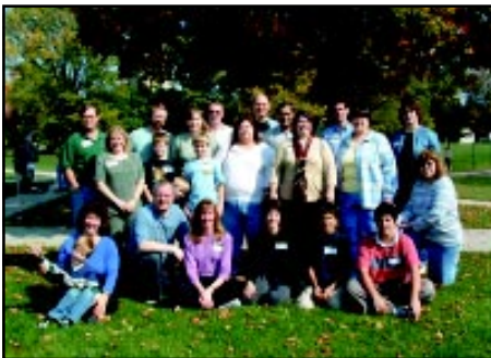
"The Family" reunion