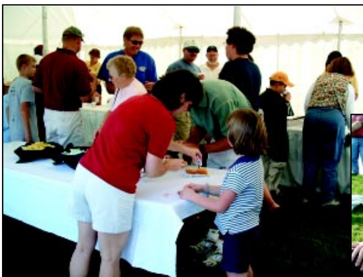
Left: Alumni enjoy hotdogs, cider and doughnuts in the Alumni Tent, which is hosted by the Alumni Board.