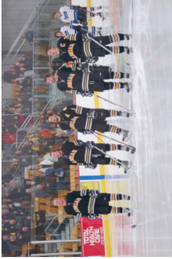
Arrington Ice Arena