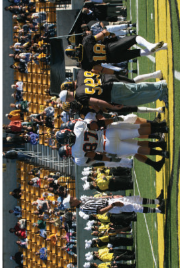
Multisport Performance Stadium