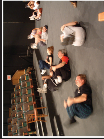
Downs Hall Theatre